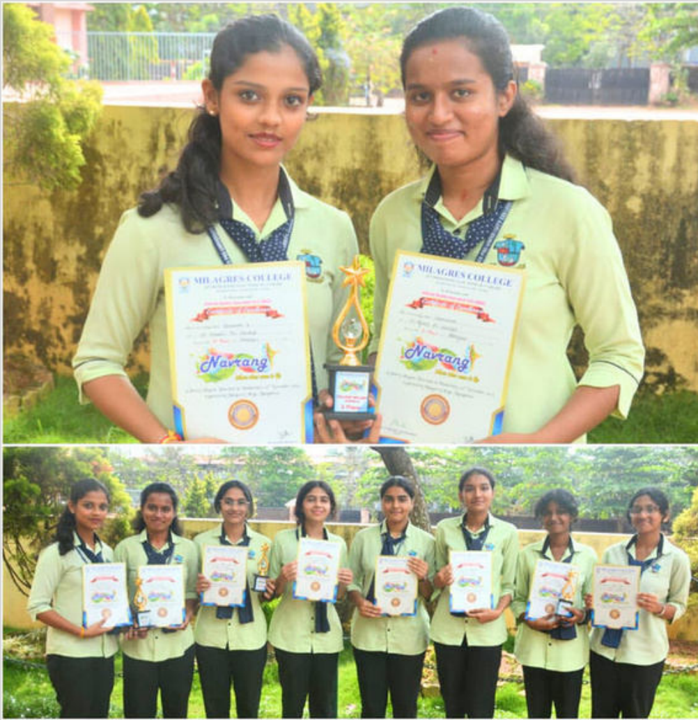
Winners of ‘Navrang’, Intercollegiate Fest held at Milagres College, Mangalore