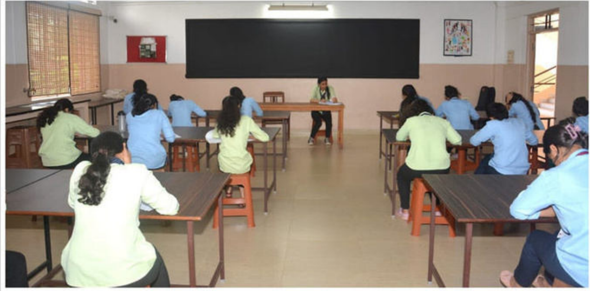
‘RACONTEUR’ English Creative Writing Competition