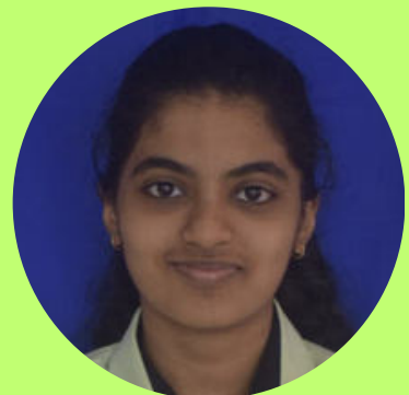
Sakshi II PCMC 'D'