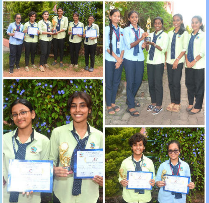
Winners of 'CELESTIA', a National Level Intercollegiate competition held at St Agnes College