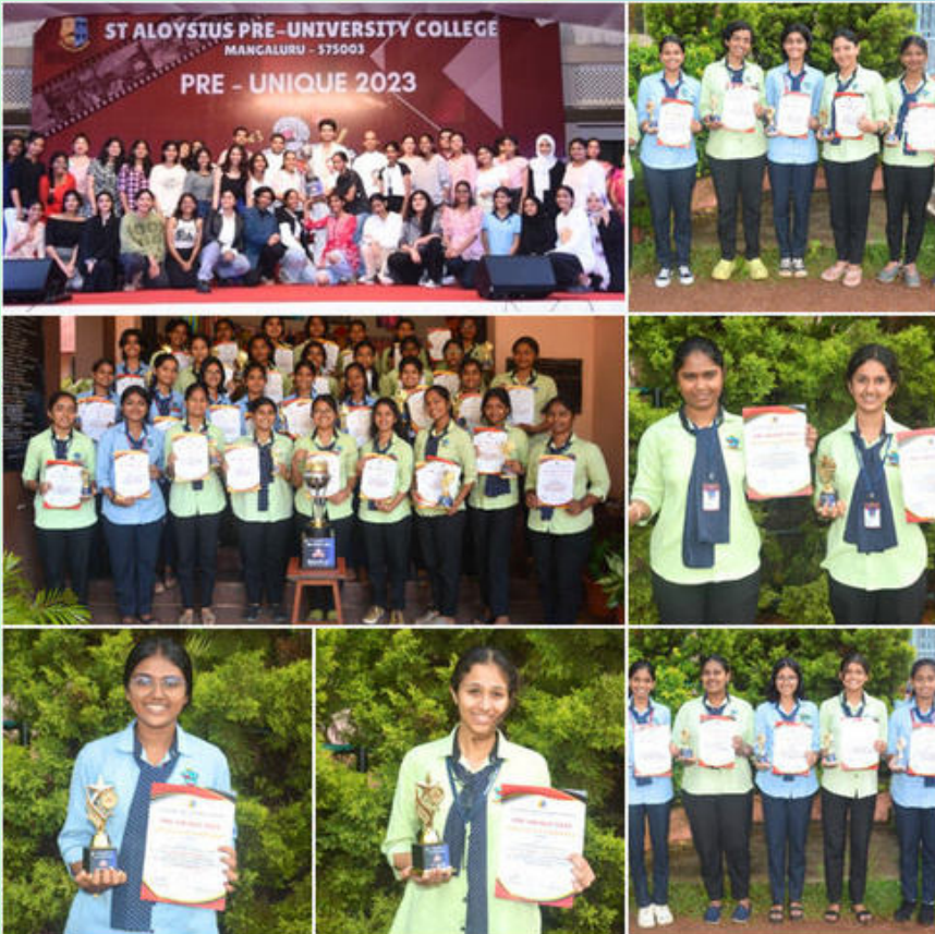
Winners of 'Pre-Unique 2023', Intercollegiate Fest held at St. Aloysius PU College, Mangalore