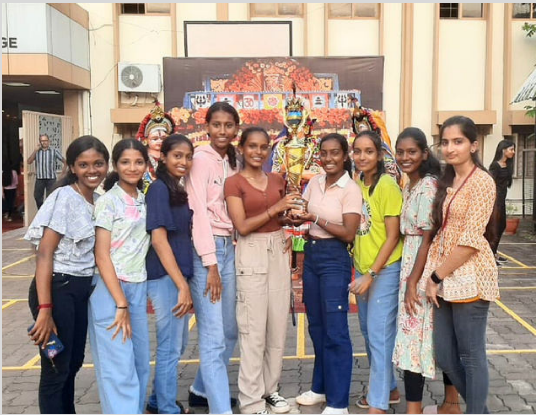
Winners of group dance event held at ‘Footprint’, an intercollegiate Fest held at Canara PU College, Mangalore