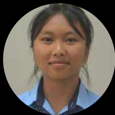
Lhingnunem I HEPP