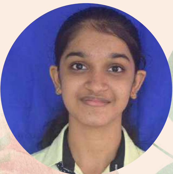
Stelina II PCMB 'C'