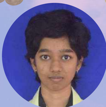
Unnati A II SEBA 'B'