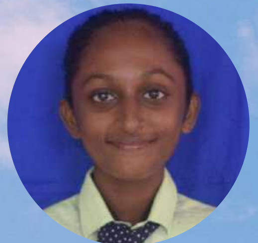
Navashree II HEPP